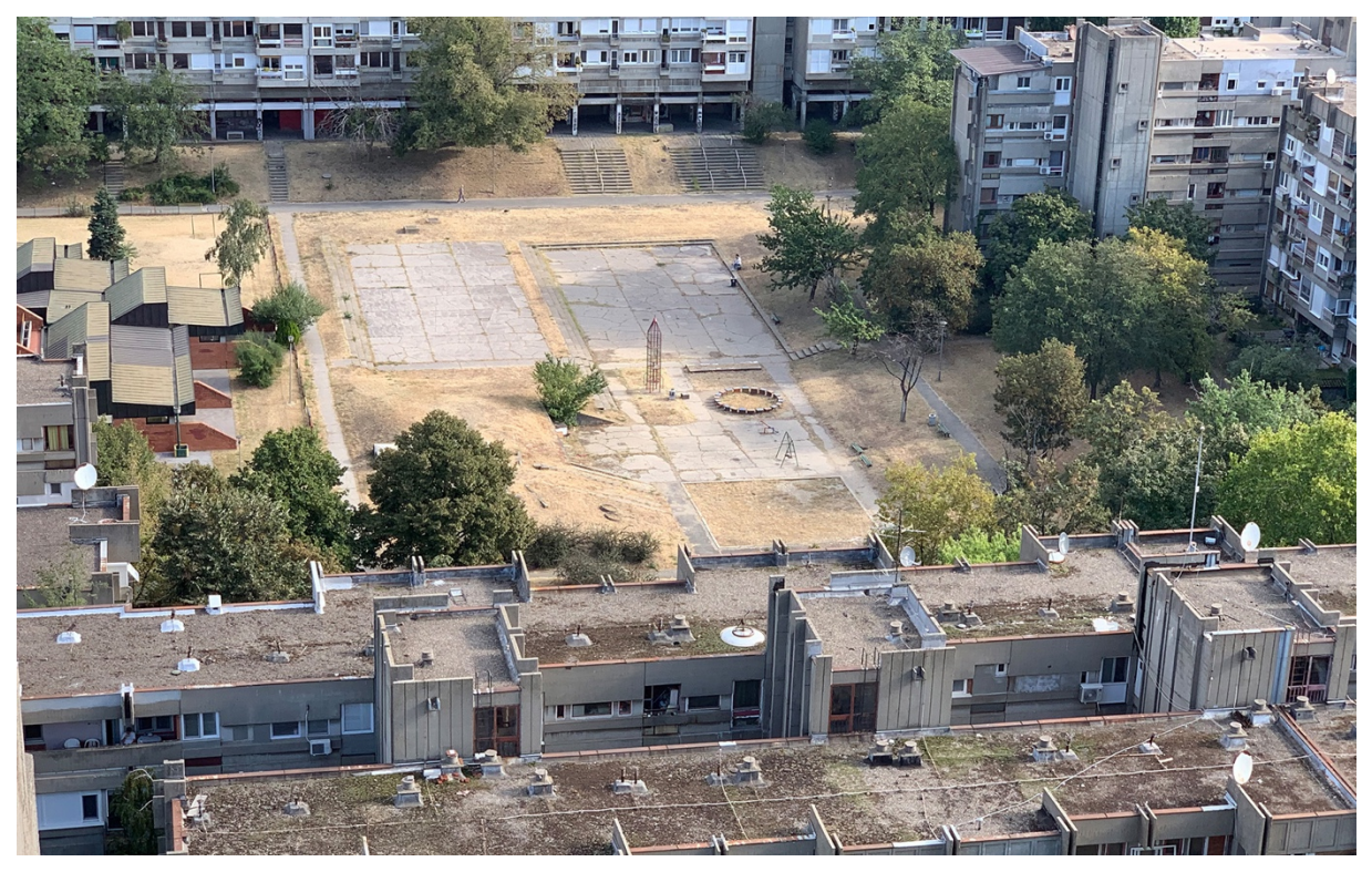
Figure 2. New Belgrade common spaces.