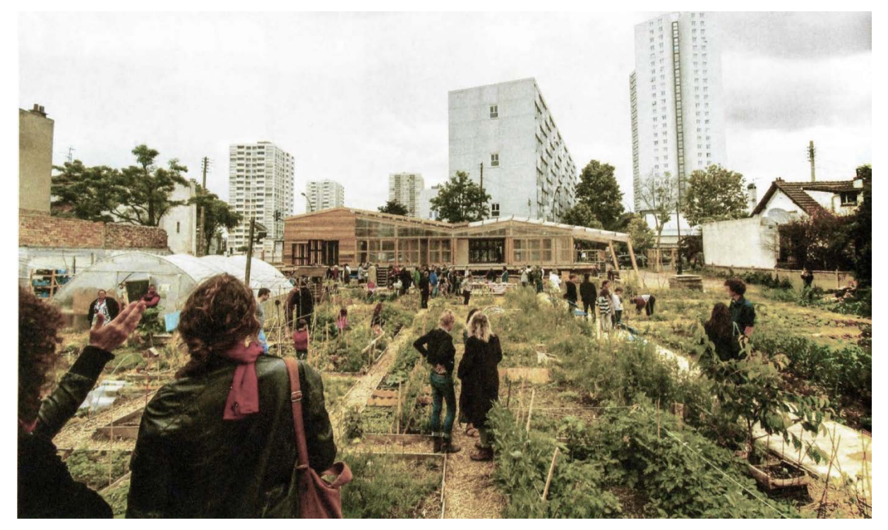
Figure 1. R-urban, AAA, 2008. (Photography © Andreas Lang, Source: Hiller et al., 2018)