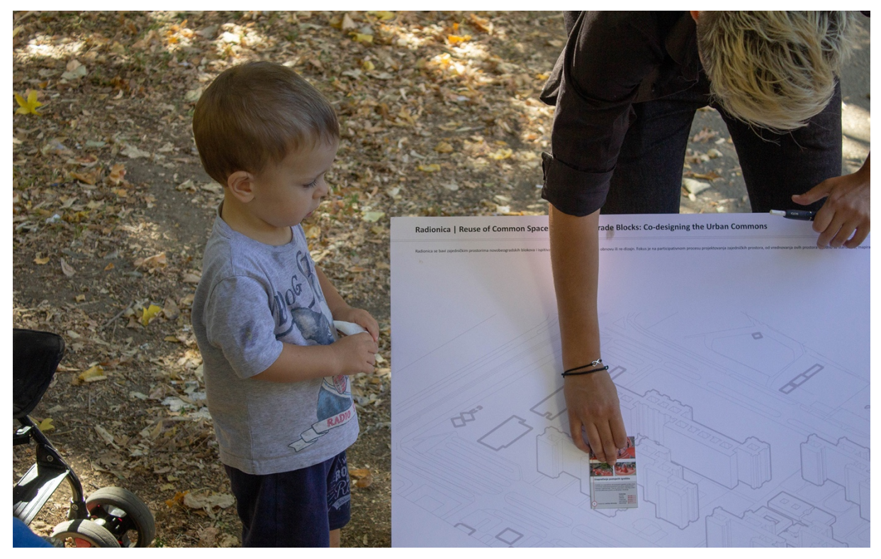
Figure 4. Participatory mapping, New Belgrade.

It was organised as an open session with representatives of different expertgroups, such as heritage experts, policy makers, environmental experts, local authorities, urbanists, activists, citizens associations, residents and academia representatives. The open session enabled exchange of opinions and views through a guided and interactive discussion. The question of collaborative urban governance in mass housing revitalization and its implementation potential was addressed in relation to the existing national and international policies, planning frameworks, ownership situation and maintenance regulations. Therefore, it acted as a co-validation of the previous studies and reality check.