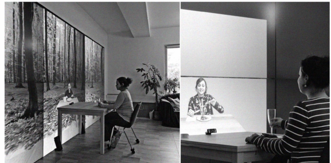
Fig. 1. roomXT video chat settings.

While pervasive healthcare technologies enable elderly and disabled people an independent life in their own home, they also bear the risk of reducing social contacts to a bare minimum. A number of projects have addressed this problem by designing special communication devices for supporting awareness and informal communication among distributed family members and friends. In comparison to traditional communication technologies, which were designed to support goal-oriented information exchange, these new systems focus