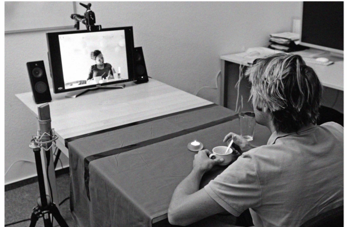
Fig. 3. Setup at the remote site.

Audio transmission is accomplished with the Apple iChat application. Using Apple iChat in our local area network results in good audio quality with acceptable acoustic echo cancellation. Due to the jitter-free throughput in our local wired network, a time synchronized video playback or synchronization of audio and video during playback is not required. Simple decoding and displaying of the video images together with audio from iChat is sufficient for a flawless videoconference experience. The quality of the video conferencing system seems to be superior to many consumer level solutions. Especially the low latency is essential for natural human communication. However, the camera resolution and the pixel density of the wall-sized display are somewhat limited.