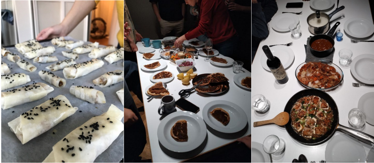
Events organized by interns at intern's apartment. (Turkish, Greek, Cantonese Cuisine)