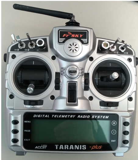
Figure 1: Currently, most non-autonomous drones are controlled by more or less complex remote control transmitters (RCT). The image shows one of the complex models.