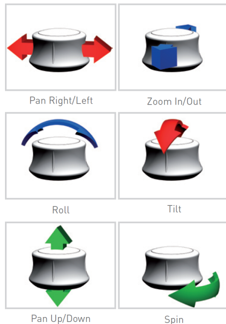
Figure 4: Degrees of freedom (DOF) of the 3-D mouse used in our exploration (Figure based on [12]).

[14]. Wearing PULSIT, users can control a drone by moving their hand and making specific gestures with their fingers. In summary, it can be said that one-hand controllers are currently still in a development stage.