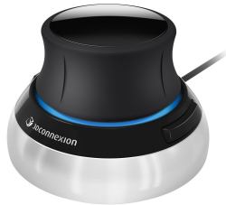
Figure 3: The device SpaceMouse® Compact from 3Dconnexion [1] was used for our exploration.